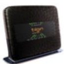
HG 1200 series